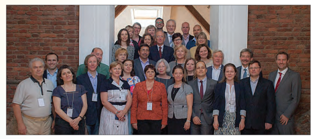
Meeting of ERA.Net RUS Plus Funding Parties

On 1/2 July 2015, 20 funding parties from Austria, Belgium, Estonia, Finland, France, Germany, Latvia, Moldova, Poland, Romania, Slovakia, Switzerland, Turkey and Russia met at Saint Petersburg State University to take a final decision on multilateral research projects to be funded in the framework of the ERA.NET Plus with Russia.