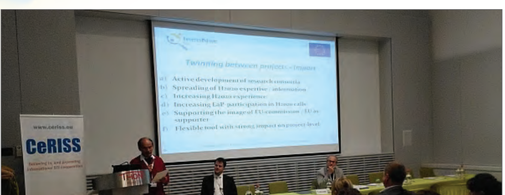
Workshop 'State of Affairs and Future of the EU-EaP STI Cooperation'

IncoNet EaP and Inconet CA – international cooperation network projects funded under the FP7 Programme of European Commission – organised two adhoc workshops on the 'State of Affairs & Future of EU-Eastern Partnership and EU-Central Asia STI Cooperation' in Brussels, on 3 September 2015.