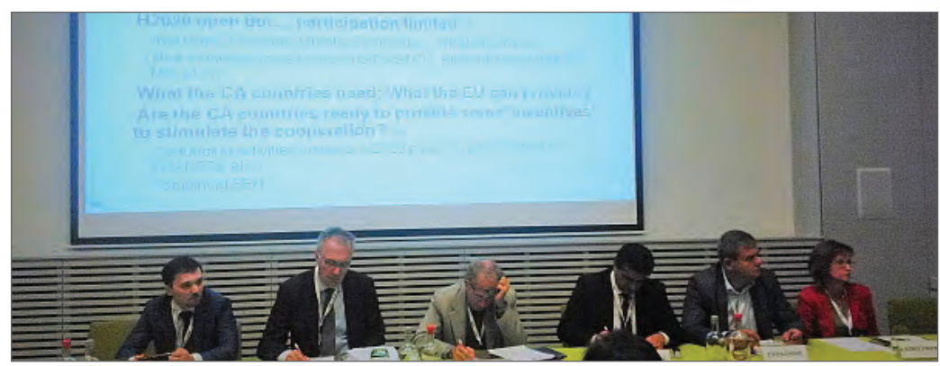
Workshop 'State of Affairs & Future of EU-Central Asia STI Cooperation'

IncoNet CA consortium partners, triggering in-depth discussions related to the state of affairs of EU-CA cooperation as well as to future challenges and how these could be settled in a most efficient way.